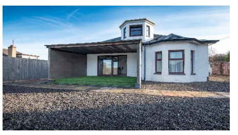
"Detached Chalet Style Bungalow In Sought After Location"

Accommodation: Entrance Vestibule, Hall, Open Plan Kitchen/Dining Room, Master Bedroom with En-Suite Shower Room, 2 Further Bedrooms, Shower-Room and Lounge, Double Glazing, Gas Central Heating, Driveway, Garage and Gardens.