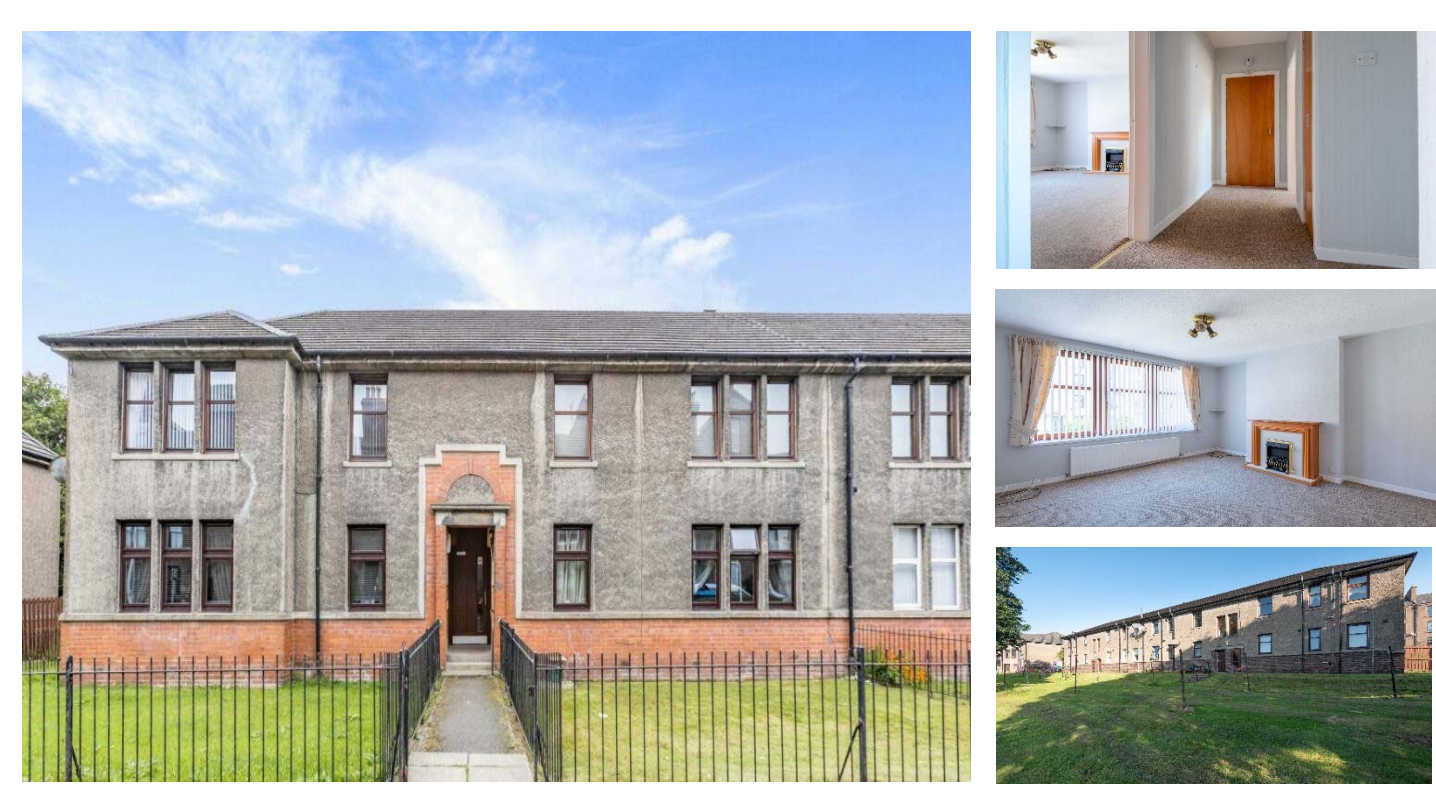
"A Great Opportunity To Buy This Upper Flat In A Popular Location"

Accommodation: Hall, Lounge, Kitchen, 2 Double Bedrooms, Bathroom, Double Glazing, Gas Central Heating, Secured Entry, Mutual Gardens.